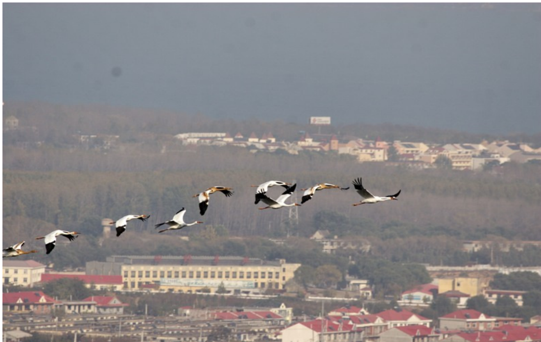
Millions of birds migrate along the east coast of China and pass through Beidaihe (CN311) in spring and autumn, including the entire world population of Siberian Crane Grus leucogeranus .

Key: ● = Protected; ◐ = Partially protected; ○ = Unprotected.